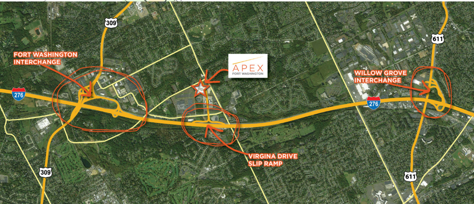
Apex Conference & Training Center

600-602 Office Center Drive Fort Washington, PA 19034